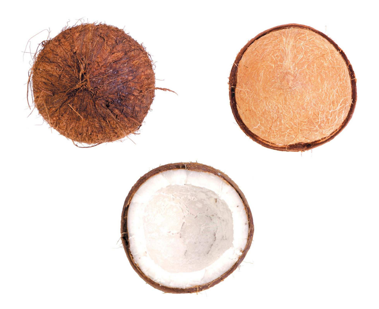
Chuck Ramirez Coconut series photograph digital print edition of 10 16 x 16" 1997