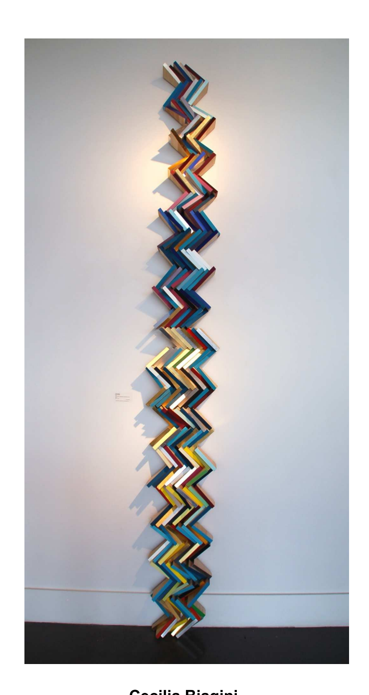
Cecilia Biagini Plural Equality acrylic paint, composition and aluminum leaf, wood 110 x 15 x 8" 2014