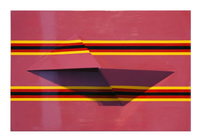
Hersúa Untitled enamel on wood 8.3 x 15.7 x 23.6" 1971