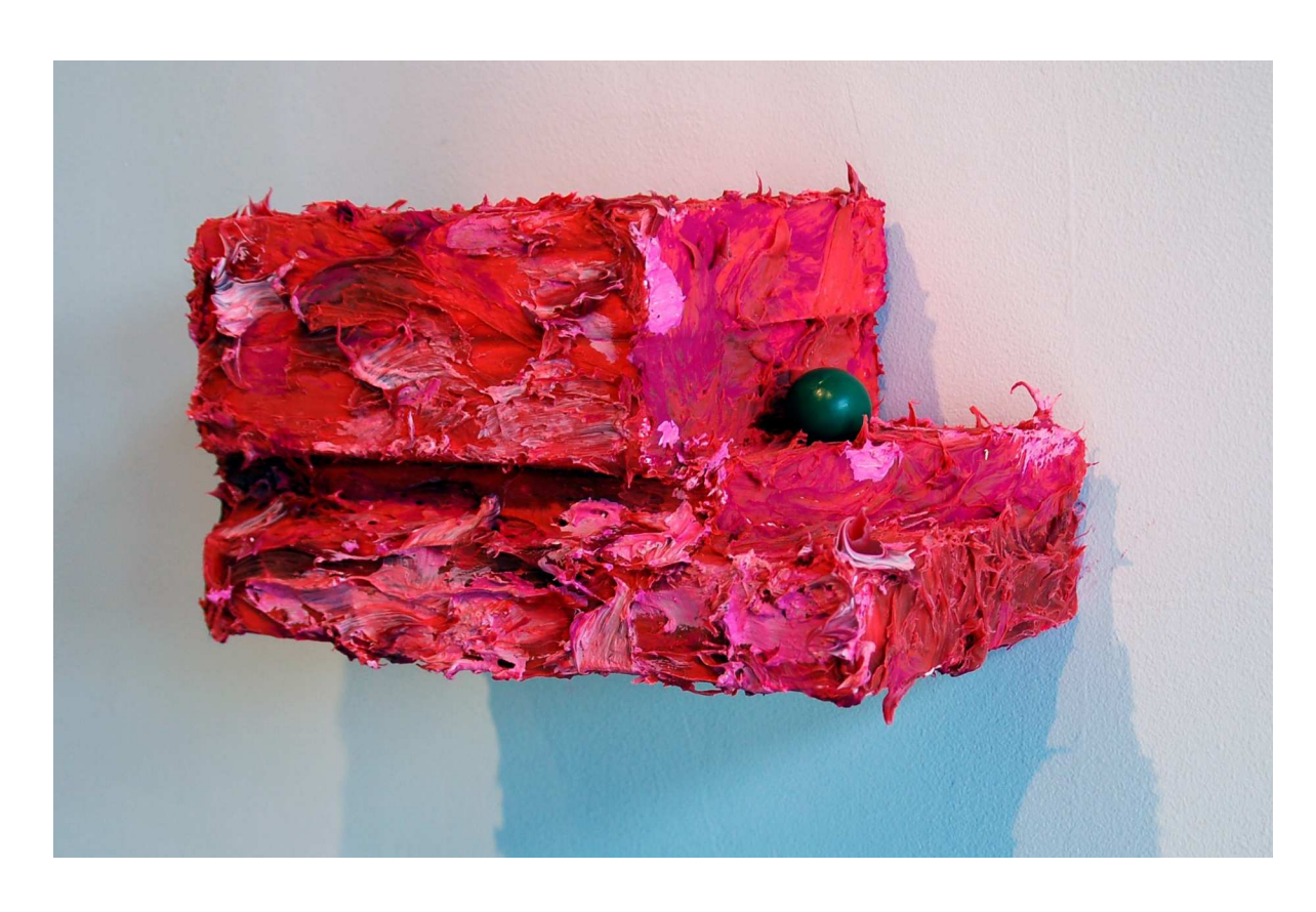
Nate Cassie Untitled (Prop)

acrylic polymer, wood, epoxy, metal leaf 5.25 x 11 x 5.25" 2015