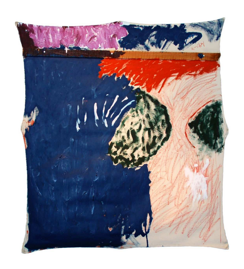
Aníbal Delgado Las medidas del sastre

oil, wax crayon, metal, and wood on cotton 37 x 33" 1983