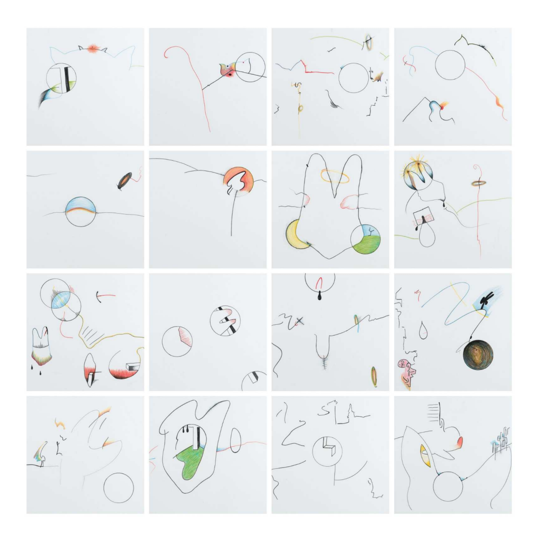
Hills Snyder Sótano de las Golondrinas